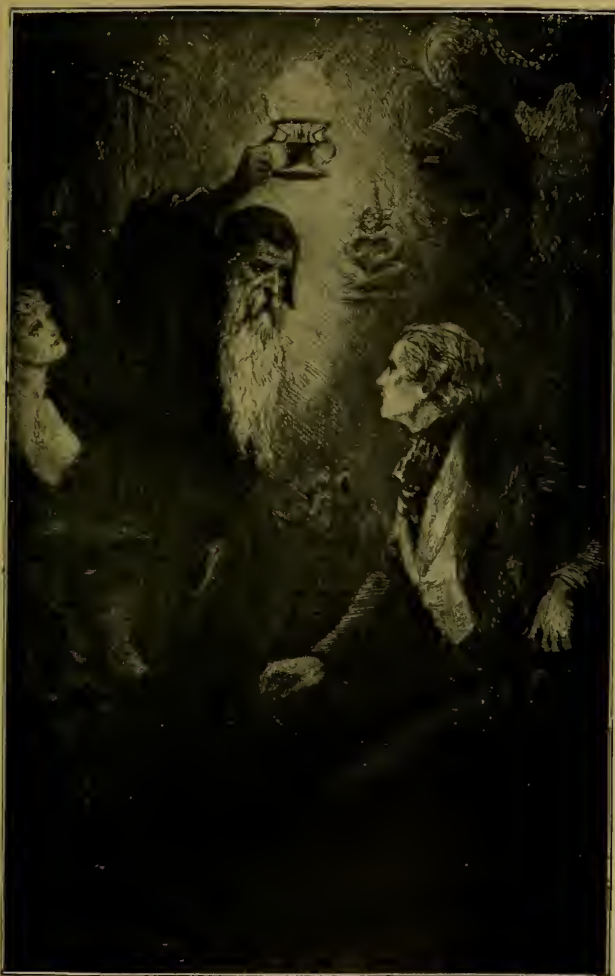
A little old man who turned the light of the lamp upon him